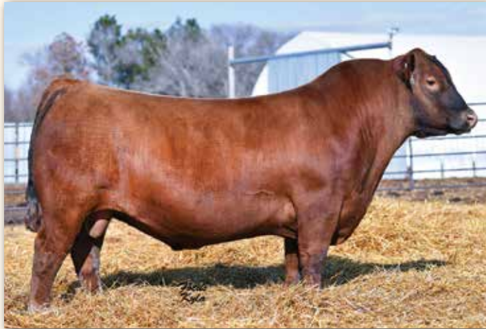
RREDS PATHFINDER F811