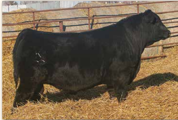
RREDS RENOVATION H037

Heifer bull that got to 720 at weaning time. His dam is an old school Oscar daughter back to one of our very best Hard Drives. This calf should sire excellent females.