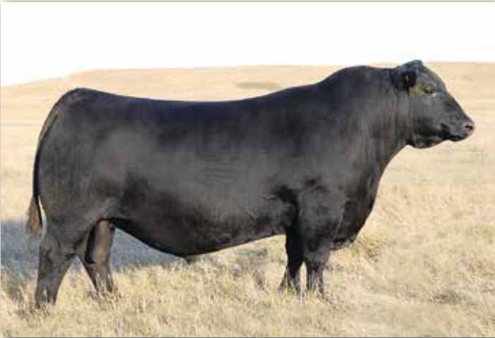
S A V BLOODLINE 9578