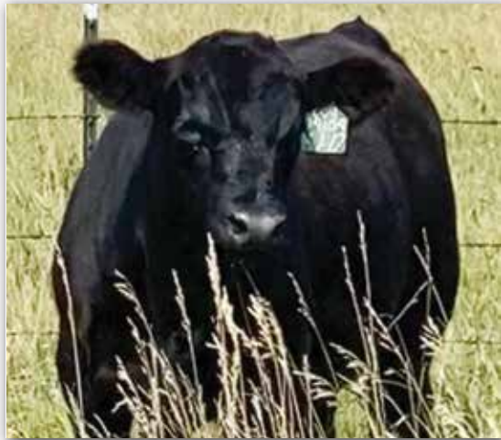
Lot 77 as a calf this summer

The last few bulls will be sold without the parentage verification. We received the wrong semen shipment and are still determining the sire of Lots 77-81.