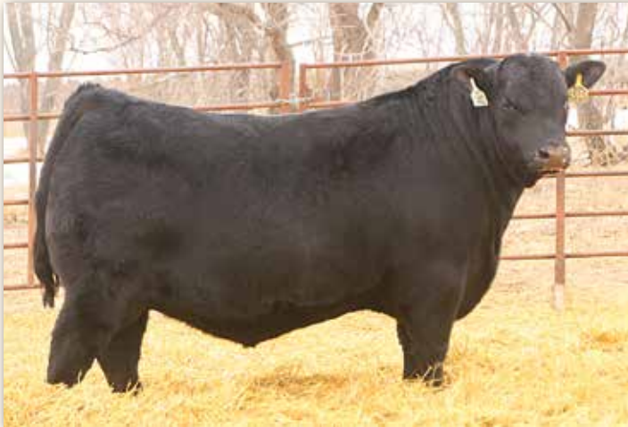
S A V ROY ROGERS 0863