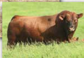
MGS to Lot 29