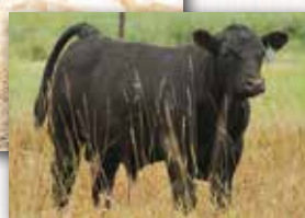
Lot 51 this summer