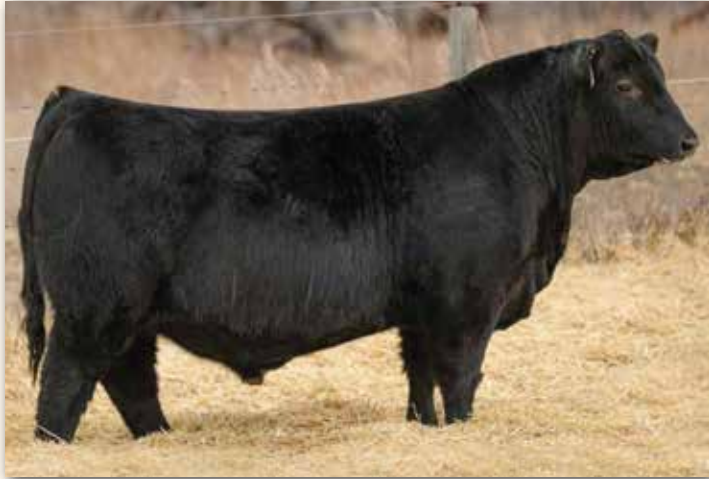
U2Q PRESIDENT 64H