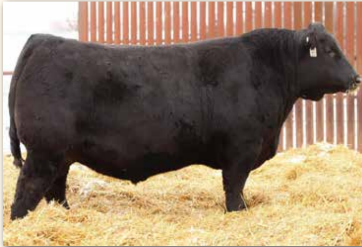
S A V GRASSLANDS 5075