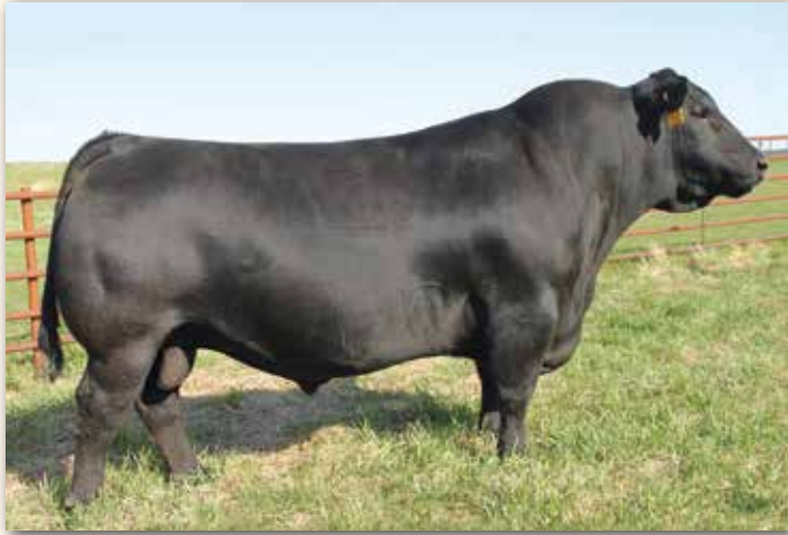
S A V RESOURCE 1441