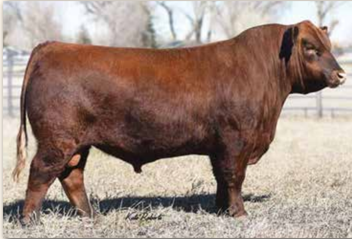
RED BAR-E-L FIRST DOWN 161D