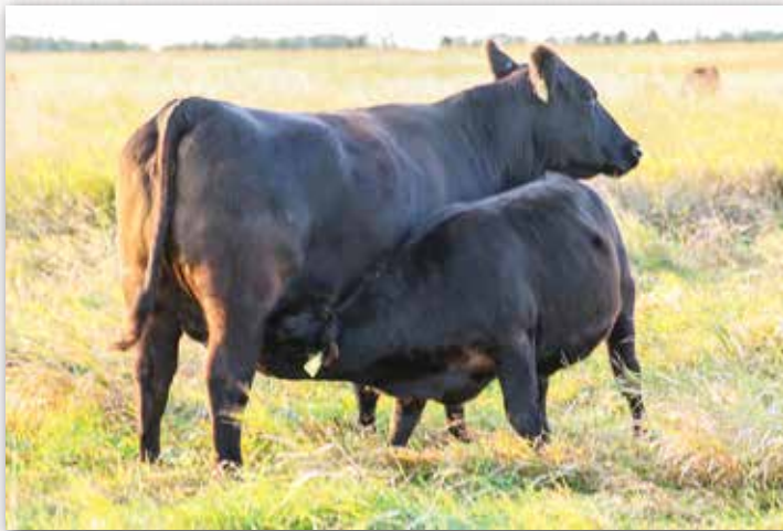
Dam to Lot 76 as a calf

A super complete 64H out of a really cool Cinch daughter. This bull's dam weighs 1250 lbs. and is one of our best production cows. She has a 355-day calving interval coming with her 6th calf. Buy with confidence if you're into momma cows that last.