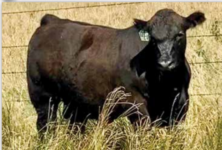
Lot 64 as a calf this summer