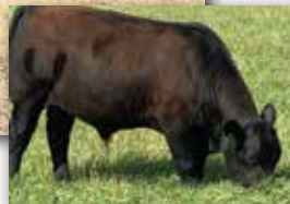
Lot 50 this summer