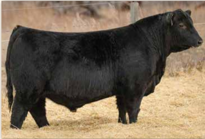
U2Q PRESIDENT 64H