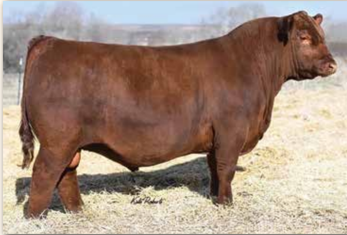
RED U2 TOWNSHIP 17G