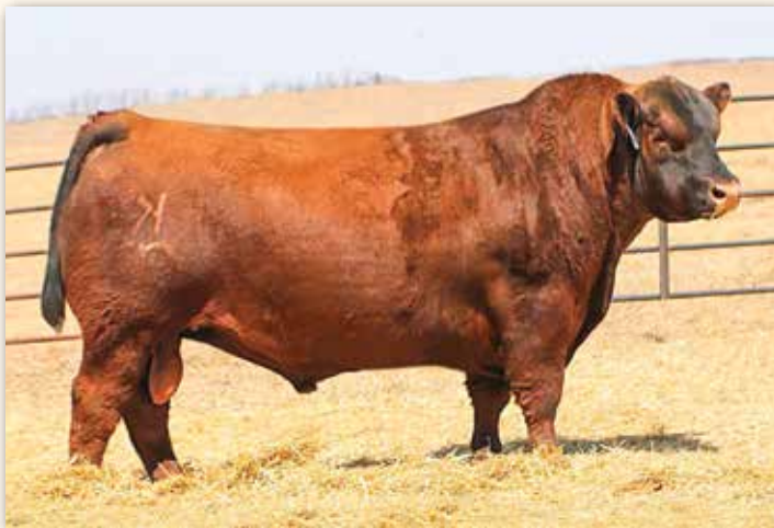
RREDS BLUE PRINT H001