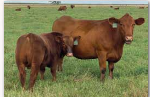
Lot 12 with his dam

One of my favorite bulls in the sale. His dam raised our high seller last year and we think she has potential. If you are looking for a bull that will add some serious muscle and thickness without adding mature size, he is the calf for you.