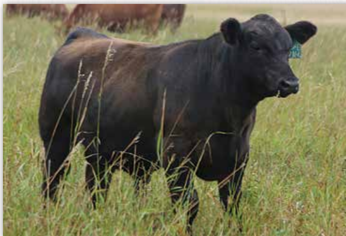
Lot 63 in early summer

One of my favorites! The Grassland bull sires about as good of a female that you could ask for and this lead off son should follow in his footsteps. His dam is a maternal sister to Let's Roll and she is slowly positioning herself into elite status. We will sample this bull on heifers this year.