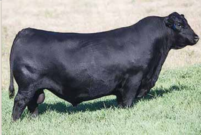
S A V Renovation 6822, sire of Minburn Renovation 25H