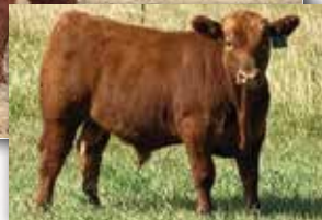
Lot 32 this summer