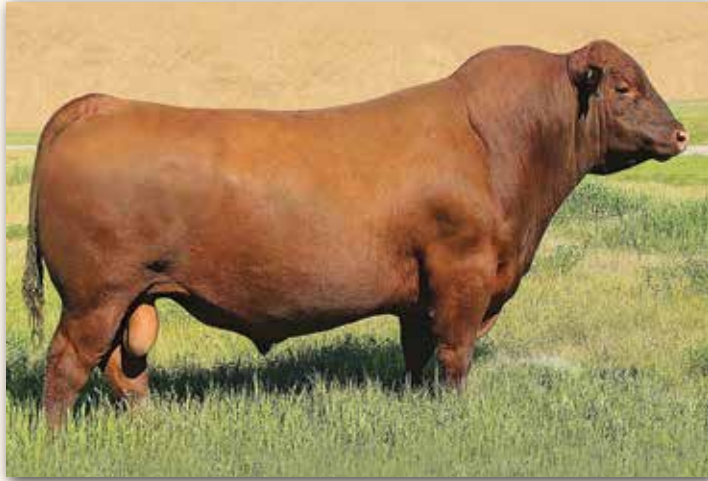
BIEBER LET'S ROLL B563