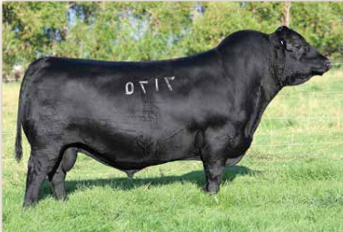
COLEMAN MARSHALL 7170