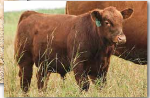
Lot 12 as a calf this summer