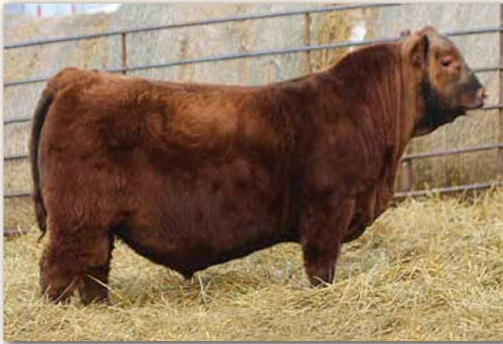
RREDS COMMON SENSE G933