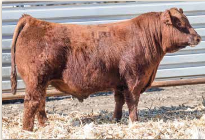
TAC DRIFTER H10