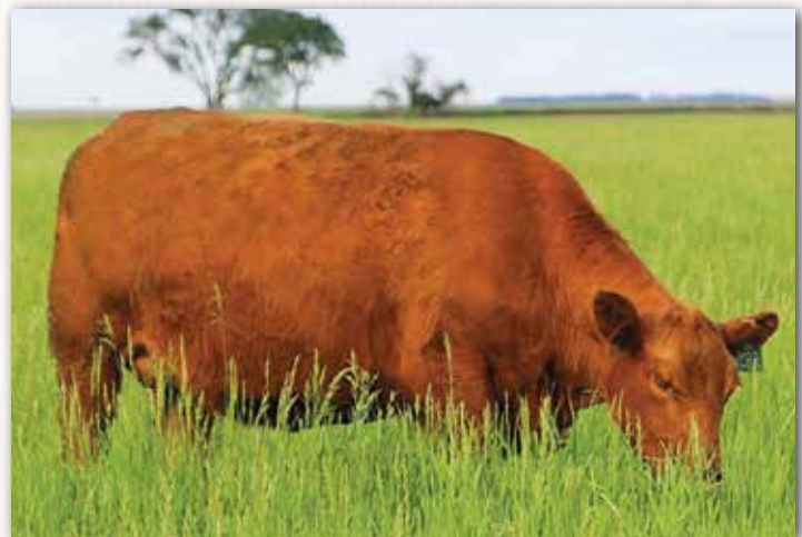
Dam to lot 63