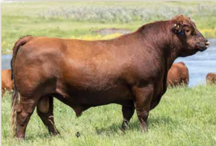
RED LWNBRG SLOWBURN 102H