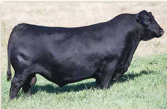
S A V Renovation 6822, sire of RREDS Renovation H0102